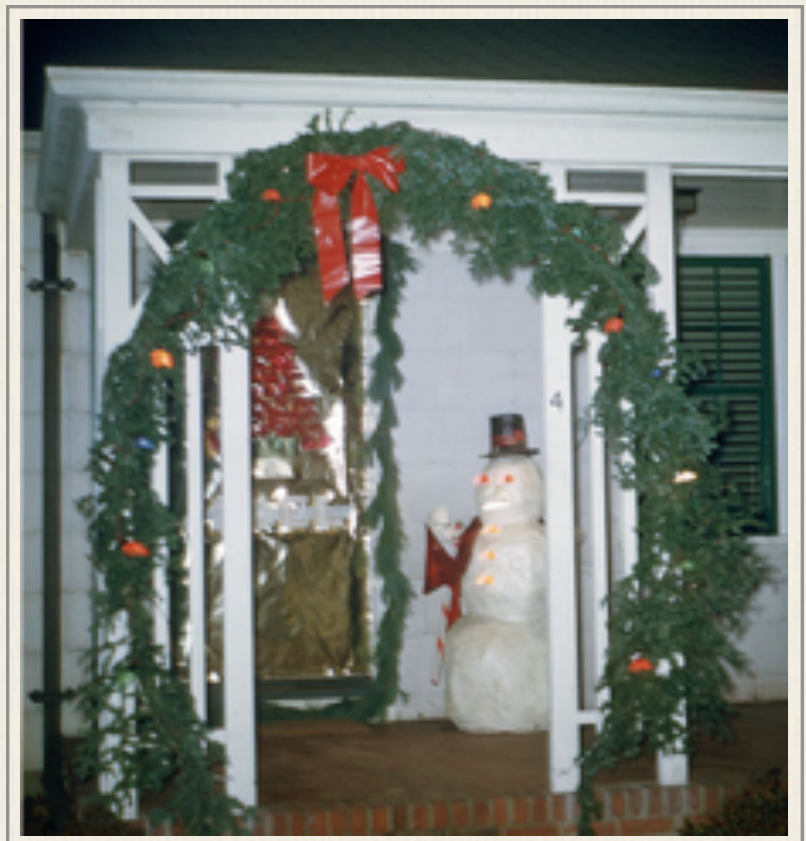
Our home at Christmas