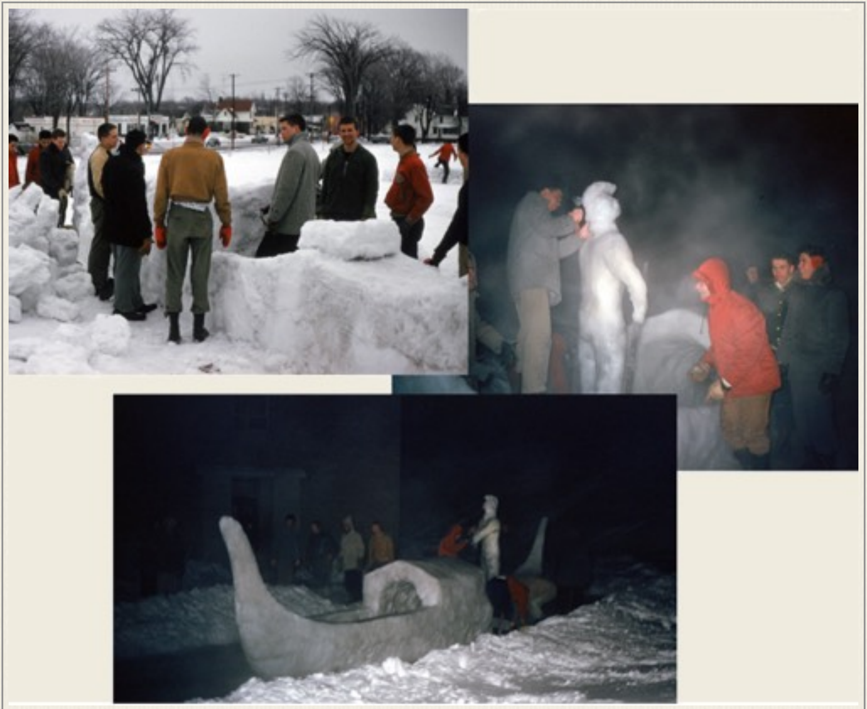
Building an ice statue for Ice Carnival in my freshman year

During my graduate studies I found that I really enjoyed teaching, and upon completion of my program of study, I was offered a job as an instructor at Clarkson College.