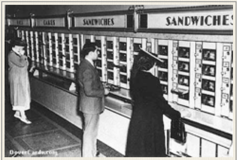
Horn and Hardart Automat

the Automat? Today, I would not be impressed. I'd rather go to a nice sit-down fancy restaurant, have a well-prepared meal and a glass of wine. But as a kid, the Automat was a truly wondrous place. You picked up a cafeteria tray and queued in front of banks of little windows, each of which had a sandwich, a salad, a roll, a piece of cake or pie... anything that