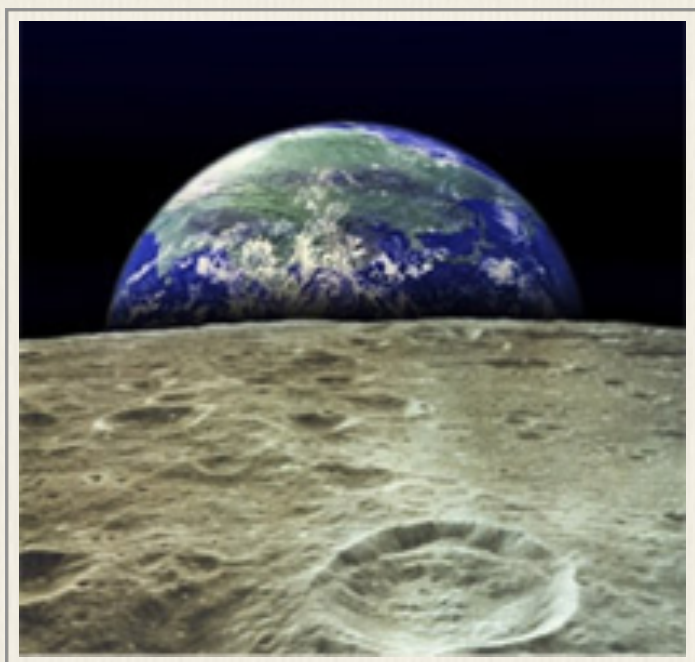
The Earthrise from the surface of the moon

During my senior year in high school, the Soviet Union launched the first successful artificial satellite into low earth orbit. Four years later, the Soviet Union again beat America by announcing to the world that cosmonaut Yuri Gagarin had become the first human in space. The U.S. program was beset by launchpad failures and national malaise set in regarding America's technological superiority. During his first term as President of the United States, Jack Kennedy set the nation on a course to regain the lead in space exploration. On May 25, 1961, President John F. Kennedy announced before a special joint session of Congress the dramatic and ambitious goal of sending an American safely to the Moon before the end of the decade. During the decade of the 1970s the nation built the technology for the moon landing through a series of manned space programs including Mercury, Gemini, and finally Apollo. We gathered around our TV set on 5 MAY 1961 and watched Walter Cronkite's live broadcast of the launch of Navy Commander Alan Shepard aboard the Freedom 7 space capsule, the first American astronaut to travel into space. 7-5 On 15 JUL 1969 three astronauts, Neil Armstrong, Buzz Aldrin, and Michael Collins blasted off from the Kennedy Space Center and 20 JUL five days later Armstrong and Aldrin had landed on the moon. The lunar module Eagle descended from the command module piloted by Collins