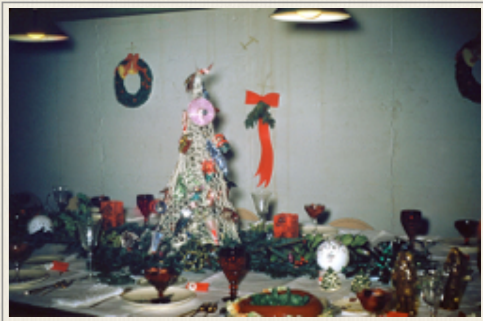
Ping pong table transformed for the feast