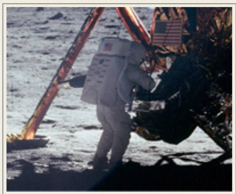
Neil Armstrong setting foot on the moon